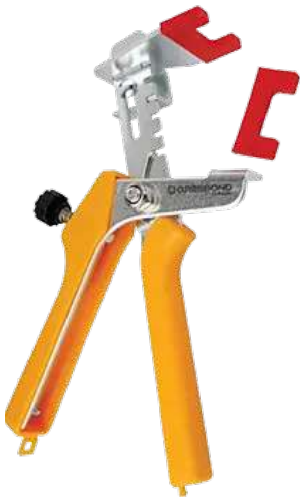
Tile leveling plier