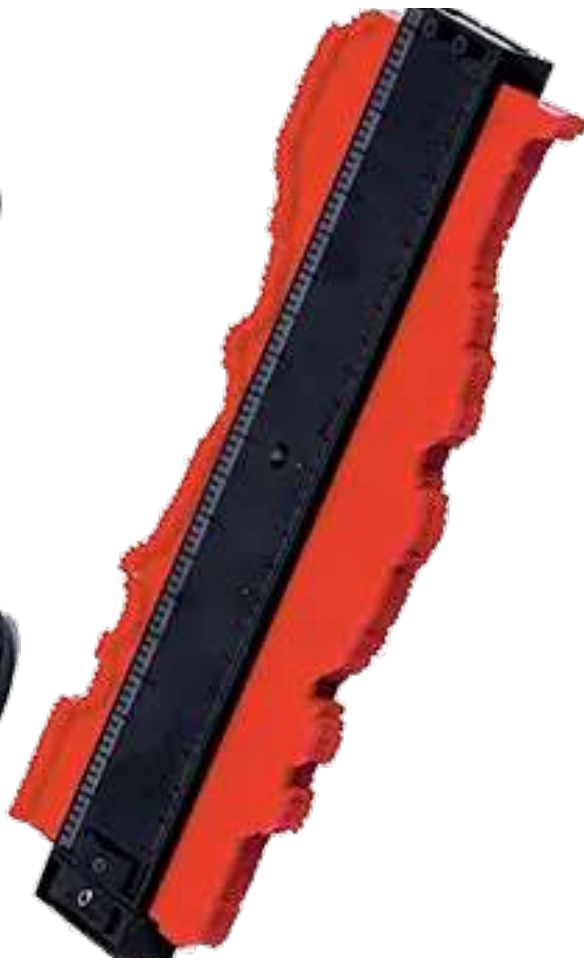
Tile shaping tool